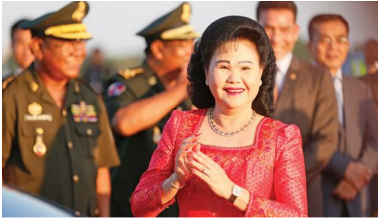
First Lady Bun Rany doesn't feature on Khmer Wikipedia.

Free SMS to Agent. Enquire Now!. 100K+ Real Listings At Your Reach.